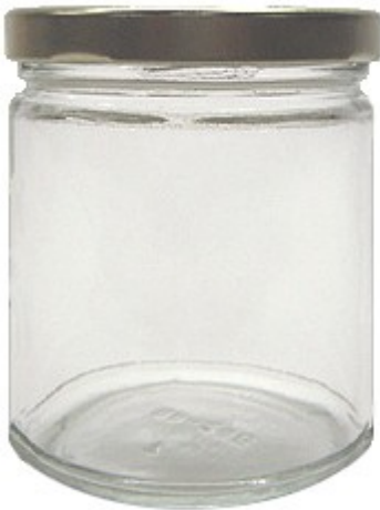
Jar: Can be used to hold liquids and powders.