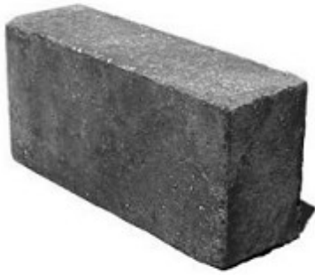
Brick: Heavy and difficult to break.