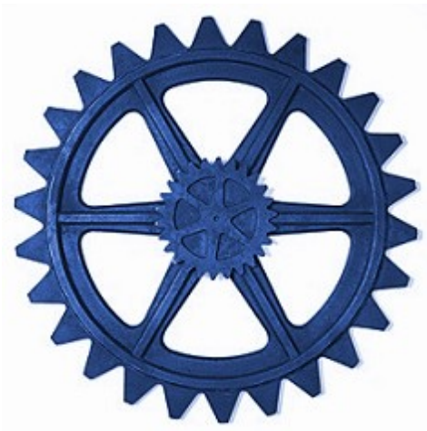
Gear: Comes in three colors, but is that the only difference?